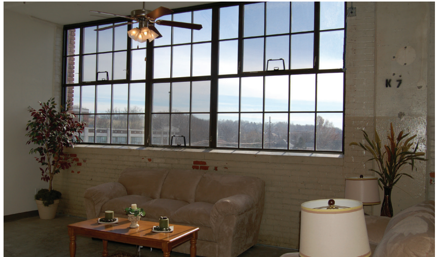
Mitchell Park Plaza

Whether you want a loft, an apartment or a house, St. Joseph has rental options for you!