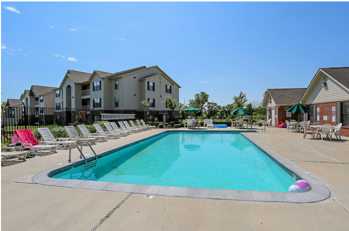
The Ridge of St. Joseph