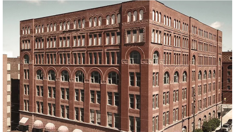
American Electric Lofts